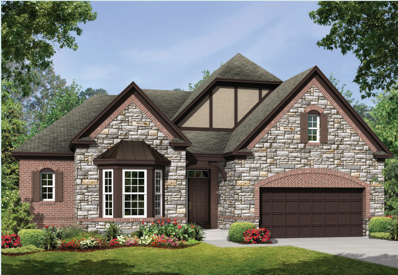
Elevation D shown w/ opt. stone