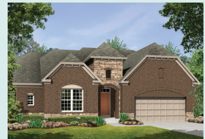
Elevation C shown w/ opt. stone