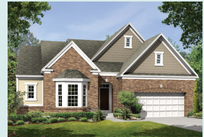
Elevation B shown w/ opt. full brick front