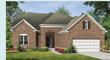
Elevation D show w/ opt. stone