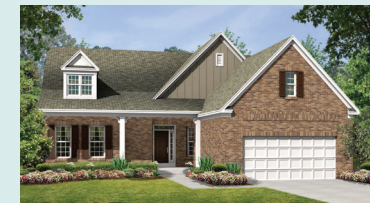
Elevation C shown w/ opt. dormer