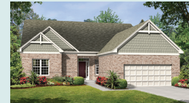
Elevation A shown w/ opt. brick