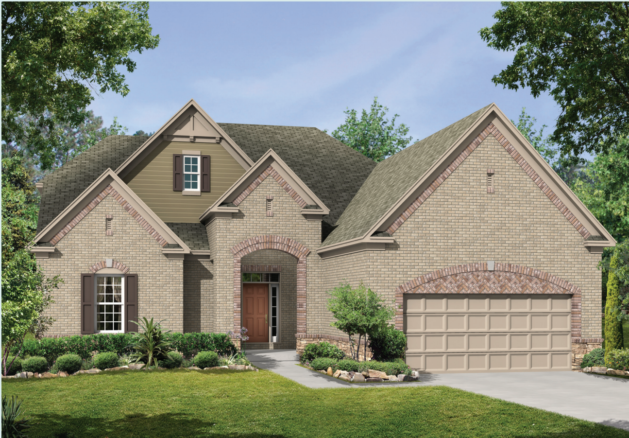
Elevation E shown with optional stone and second floor