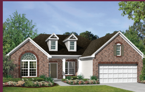
Elevation E shown w/Opt Dormers