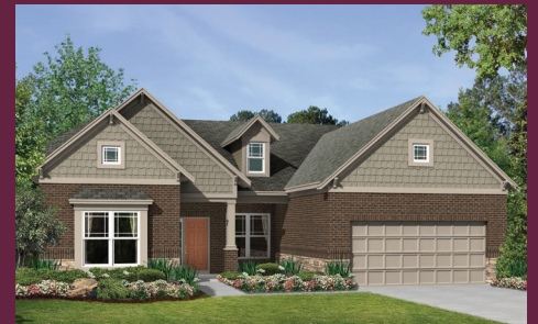
Elevation G shown w/Opt Stone and Dormer

Square Feet: 2,188 Bedrooms: 3 Full Baths: 2