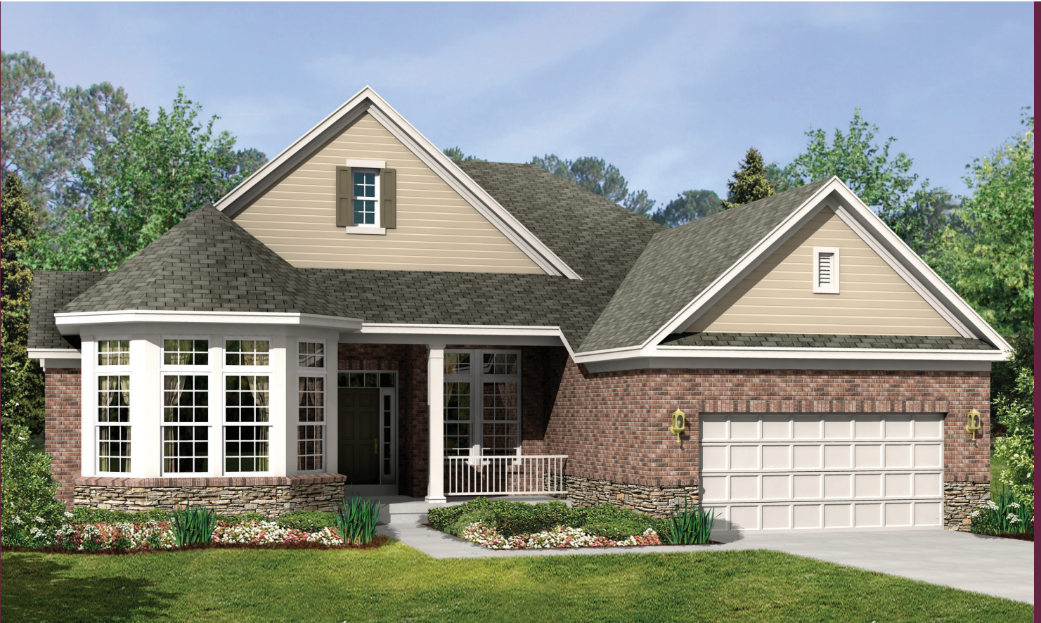
Elevation B shown w/Opt Stone